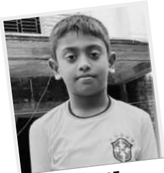
22 nd Feb 25 Muhin found Dead next day