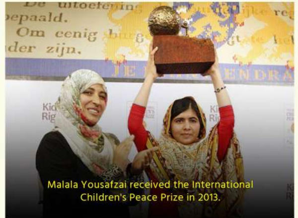
Malala Yousafzai received the International Children's Peace Prize in 2013.

Cyber Teens is a pioneering initiative dedicated to enhancing online safety for teenagers across Bangladesh. Through its comprehensive helpline, educational programs, and community outreach, it tackles cyberbullying, online harassment, and digital privacy issues.